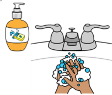
put soap on your hands